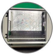
ADJUSTABLE Projector Shelf