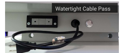
Watertight Cable Pass