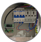
DUAL BREAKERS Outlets / Thermostat