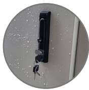
WEATHERPROOF with Locks